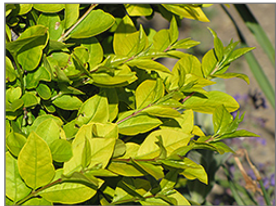
Golden Privet foliage