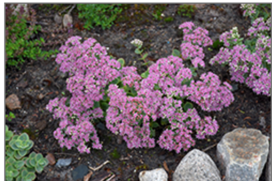
Lime Twister Stonecrop in bloom