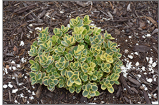
Lime Twister Stonecrop