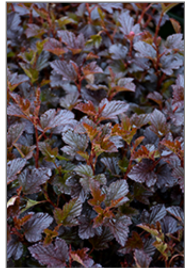
Petite Plum Ninebark foliage