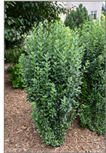
Straight Talk Privet