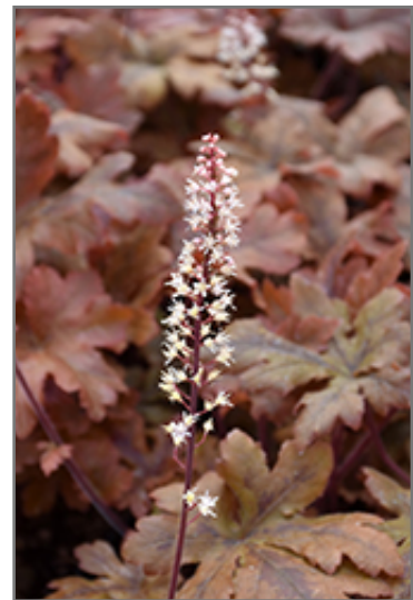
Hopscotch Foamy Bells flowers