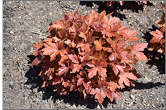
Hopscotch Foamy Bells