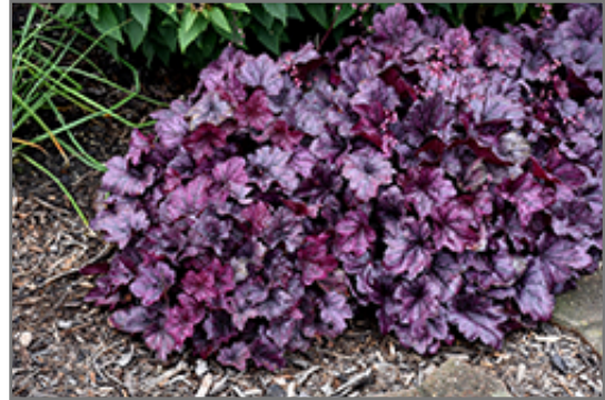
Wild Rose Coral Bells

Wild Rose Coral Bells is a dense herbaceous evergreen perennial with tall flower stalks held atop a low mound of foliage. Its relatively coarse texture can be used to stand it apart from other garden plants with finer foliage.