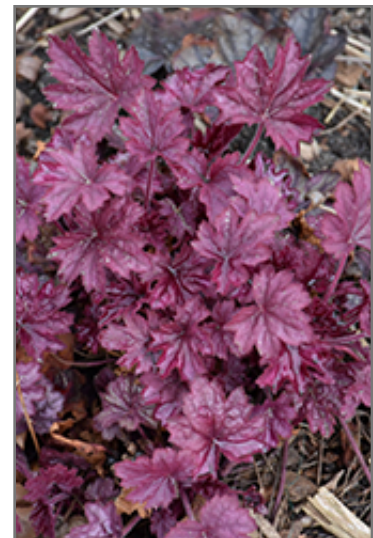
Wild Rose Coral Bells foliage