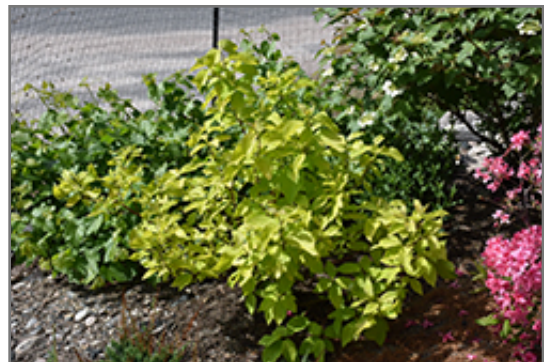
Neon Burst Dogwood