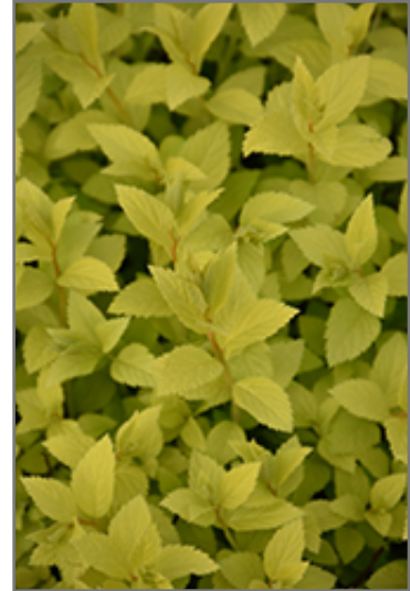
Double Play Gold Spirea foliage

This shrub should only be grown in full sunlight. It prefers to grow in average to moist conditions, and shouldn't be allowed to dry out. It is not particular as to soil type or pH. It is highly tolerant of urban pollution and will even thrive in inner city environments. This is a selected variety of a species not originally from North America.