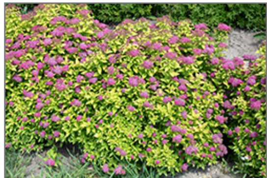
Double Play Gold Spirea in bloom