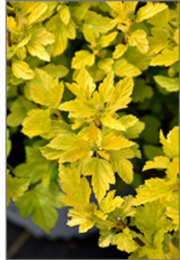
Tiny Wine Gold Ninebark foliage

Tiny Wine Gold Ninebark is recommended for the following landscape applications;