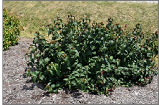
Kodiak Black Diervilla