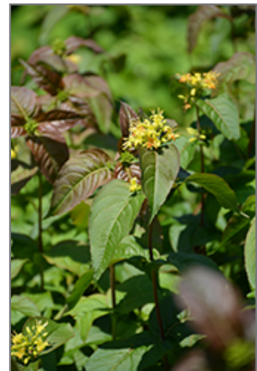
Kodiak Black Diervilla flowers