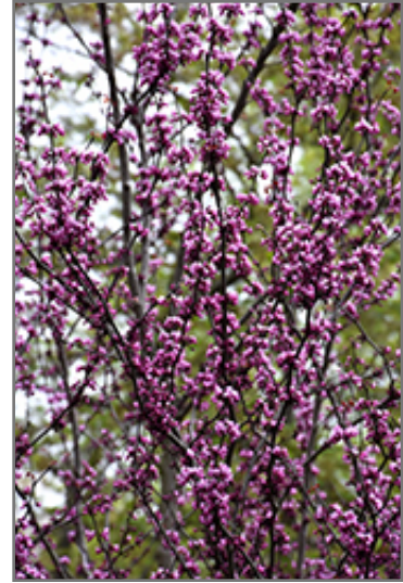
Merlot Redbud flowers

This tree does best in full sun to partial shade. It prefers to grow in average to moist conditions, and shouldn't be allowed to dry out. It is not particular as to soil type or pH. It is highly tolerant of urban pollution and will even thrive in inner city environments, and will benefit from being planted in a relatively sheltered location. Consider applying a thick mulch around the root zone in winter to protect it in exposed locations or colder microclimates. This is a selection of a native North American species.