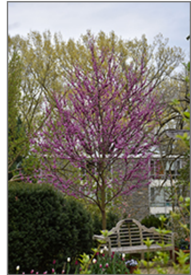
Merlot Redbud in bloom

This is a relatively low maintenance tree, and should only be pruned after flowering to avoid removing any of the current season's flowers. Deer don't particularly care for this plant and will usually leave it alone in favor of tastier treats. Gardeners should be aware of the following characteristic(s) that may warrant special consideration;