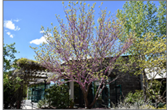
Flame Redbud in bloom

This tree does best in full sun to partial shade. It prefers to grow in average to moist conditions, and shouldn't be allowed to dry out. It is not particular as to soil type or pH. It is highly tolerant of urban pollution and will even thrive in inner city environments, and will benefit from being planted in a relatively sheltered location. Consider applying a thick mulch around the root zone in winter to protect it in exposed locations or colder microclimates. This is a selection of a native North American species.