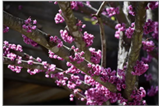
Flame Redbud flowers