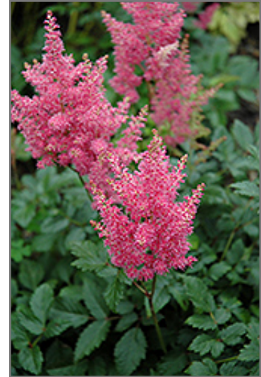
Rheinland Astilbe flowers

Rheinland Astilbe is recommended for the following landscape applications;