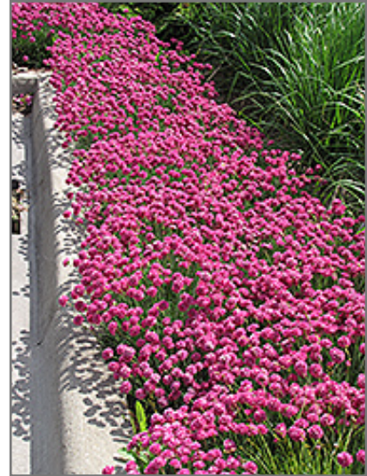
Dusseldorf Pride Sea Thrift in bloom

Dusseldorf Pride Sea Thrift is recommended for the following landscape applications;