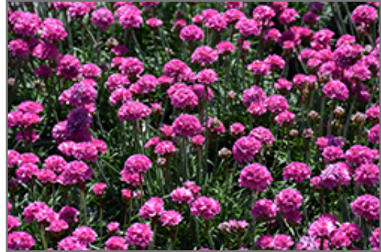
Dusseldorf Pride Sea Thrift flowers

Dusseldorf Pride Sea Thrift will grow to be only 6 inches tall at maturity extending to 8 inches tall with the flowers, with a spread of 8 inches. Its foliage tends to remain low and dense right to the ground. It grows at a slow rate, and under ideal conditions can be expected to live for approximately 10 years. As an evergreen perennial, this plant will typically keep its form and foliage year-round.