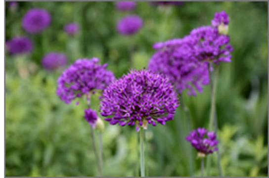
Purple Sensation Ornamental Onion flowers

Purple Sensation Ornamental Onion is an open herbaceous perennial with tall flower stalks held atop a low mound of foliage. Its relatively coarse texture can be used to stand it apart from other garden plants with finer foliage.