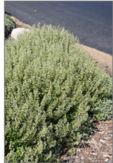
White Cloud Dwarf Calamint in bloom