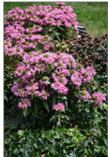
Pardon My Pink Beebalm in bloom