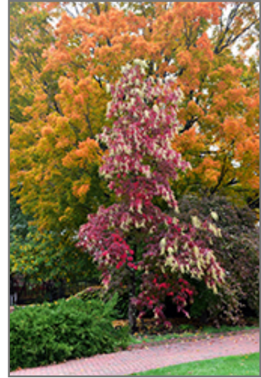
Sourwood in fall

* This is a 'special order' plant - contact store for details