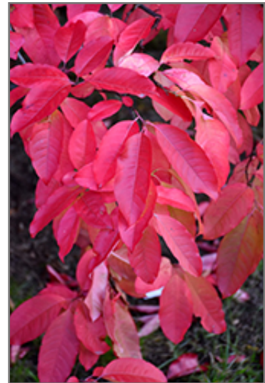
Sourwood in fall