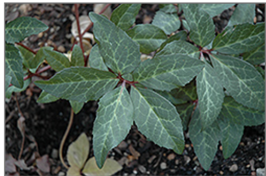
Merlin Hellebore foliage