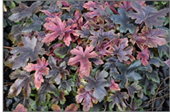
Brass Lantern Foamy Bells

Brass Lantern Foamy Bells is recommended for the following landscape applications;