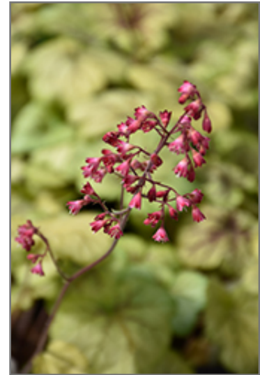
Circus Coral Bells flowers

Circus Coral Bells is a fine choice for the garden, but it is also a good selection for planting in outdoor pots and containers. With its upright habit of growth, it is best suited for use as a 'thriller' in the 'spiller-thriller-filler' container combination; plant it near the center of the pot, surrounded by smaller plants and those that spill over the edges. Note that when growing plants in outdoor containers and baskets, they may require more frequent waterings than they would in the yard or garden.