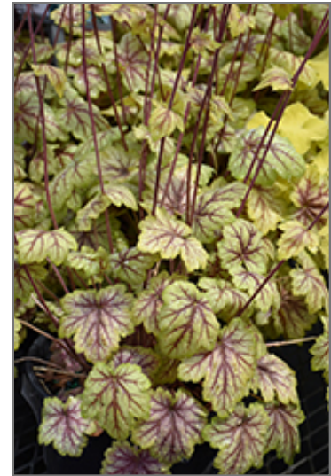
Circus Coral Bells foliage

Circus Coral Bells is recommended for the following landscape applications;