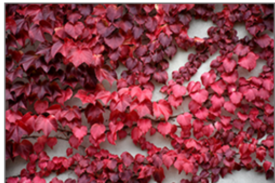
Veitch Boston Ivy in fall