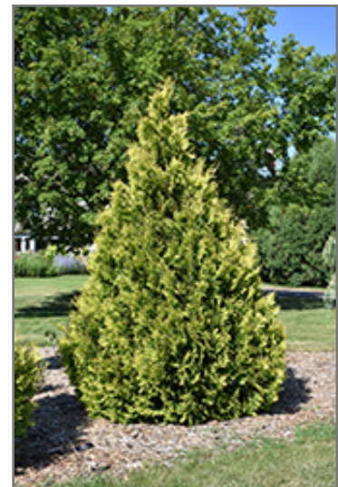
Yellow Ribbon Arborvitae