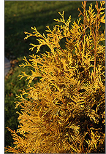
Yellow Ribbon Arborvitae in fall

This shrub does best in full sun to partial shade. It prefers to grow in average to moist conditions, and shouldn't be allowed to dry out. It is not particular as to soil type or pH. It is somewhat tolerant of urban pollution, and will benefit from being planted in a relatively sheltered location. Consider applying a thick mulch around the root zone in winter to protect it in exposed locations or colder microclimates. This is a selection of a native North American species.