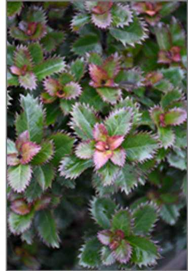
Scallywag Holly foliage