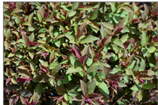
Double Play Artisan Spirea foliage