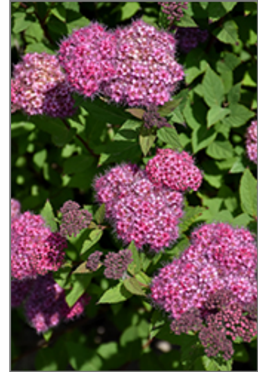
Double Play Artisan Spirea flowers

This shrub will require occasional maintenance and upkeep, and is best pruned in late winter once the threat of extreme cold has passed. It is a good choice for attracting butterflies to your yard, but is not particularly attractive to deer who tend to leave it alone in favor of tastier treats. It has no significant negative characteristics.