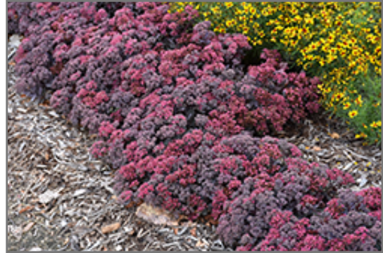
Dazzleberry Stonecrop in bloom