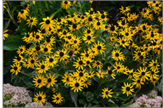
Little Goldstar Coneflower in bloom

This is a relatively low maintenance plant, and should be cut back in late fall in preparation for winter. It is a good choice for attracting butterflies to your yard, but is not particularly attractive to deer who tend to leave it alone in favor of tastier treats. It has no significant negative characteristics.