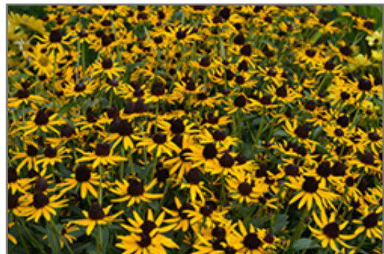
Little Goldstar Coneflower flowers