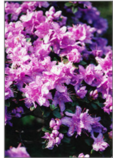
Ramapo Rhododendron flowers