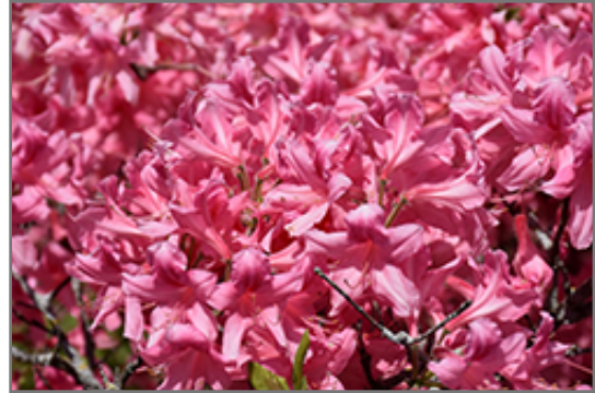
Rosy Lights Azalea flowers

Rosy Lights Azalea is recommended for the following landscape applications;