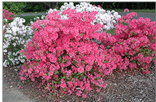
Rosy Lights Azalea in bloom