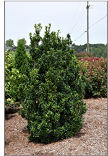
Castle Wall Meserve Holly

Castle Wall Meserve Holly is recommended for the following landscape applications;