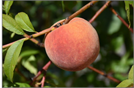
Redhaven Peach fruit