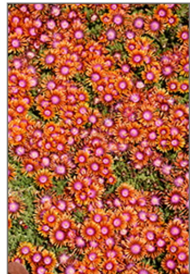
Fire Spinner Ice Plant flowers