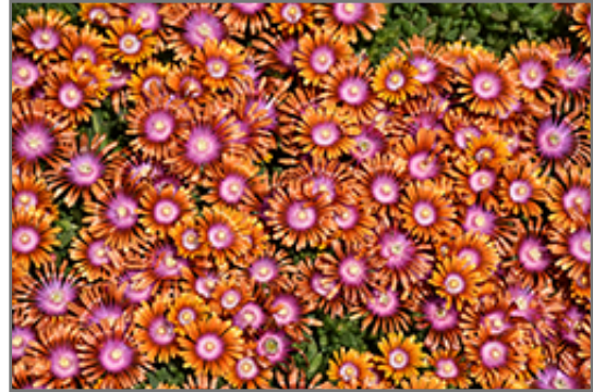
Fire Spinner Ice Plant in bloom

Fire Spinner Ice Plant is recommended for the following landscape applications;