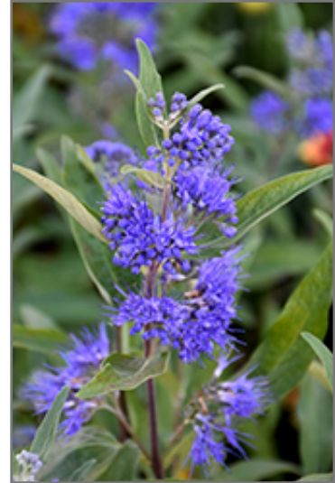
Sapphire Surf Caryopteris flowers

Sapphire Surf Caryopteris is recommended for the following landscape applications;