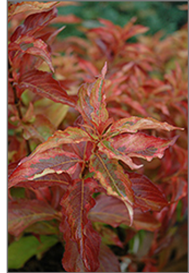
My Monet Sunset Weigela foliage

My Monet Sunset Weigela makes a fine choice for the outdoor landscape, but it is also well-suited for use in outdoor pots and containers. It is often used as a 'filler' in the 'spiller-thriller-filler' container combination, providing a mass of flowers and foliage against which the thriller plants stand out. Note that when grown in a container, it may not perform exactly as indicated on the tag - this is to be expected. Also note that when growing plants in outdoor containers and baskets, they may require more frequent waterings than they would in the yard or garden.