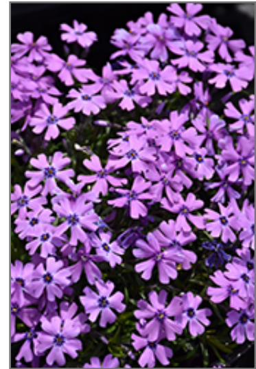
Purple Beauty Moss Phlox flowers