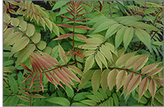
Sem False Spirea foliage

Sem False Spirea is a multi-stemmed deciduous shrub with a more or less rounded form. Its average texture blends into the landscape, but can be balanced by one or two finer or coarser trees or shrubs for an effective composition.