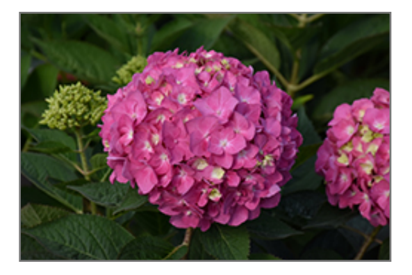
Let's Dance Arriba! Hydrangea flowers

Wasco Nursery & Garden Center 41W781 Route 64, St. Charles, IL, 60175 phone: 630.584.4424 www.wasconursery.com sales@wasconursery.com