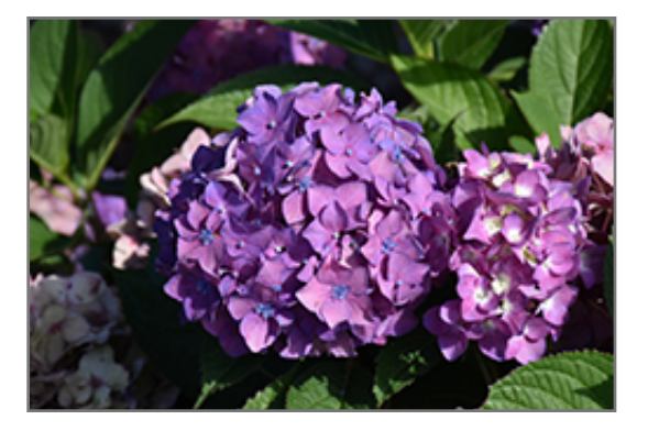
Let's Dance Arriba! Hydrangea flowers

This shrub will require occasional maintenance and upkeep, and should only be pruned after flowering to avoid removing any of the current season's flowers. It has no significant negative characteristics.