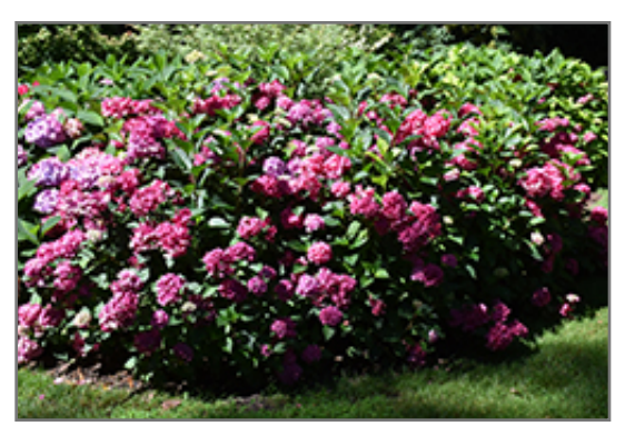
Let's Dance Arriba! Hydrangea in bloom

This shrub does best in full sun to partial shade. You may want to keep it away from hot, dry locations that receive direct afternoon sun or which get reflected sunlight, such as against the south side of a white wall. It requires an evenly moist well-drained soil for optimal growth. To help this plant achive its best flowering performance, periodically apply a flower-boosting fertilizer from early spring through into the active growing season. It is not particular as to soil type or pH. It is highly tolerant of urban pollution and will even thrive in inner city environments, and will benefit from being planted in a relatively sheltered location. Consider applying a thick mulch around the root zone in both summer and winter to conserve soil moisture and protect it in exposed locations or colder microclimates. This particular variety is an interspecific hybrid.