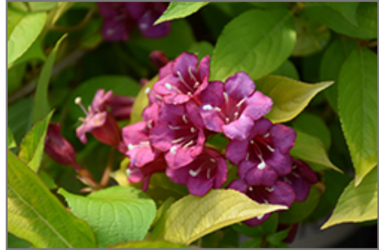
Golden Jackpot Weigela flowers

Golden Jackpot Weigela is recommended for the following landscape applications;