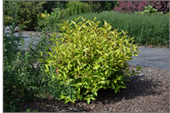
Golden Jackpot Weigela

Golden Jackpot Weigela makes a fine choice for the outdoor landscape, but it is also well-suited for use in outdoor pots and containers. Because of its height, it is often used as a 'thriller' in the 'spiller-thriller-filler' container combination; plant it near the center of the pot, surrounded by smaller plants and those that spill over the edges. It is even sizeable enough that it can be grown alone in a suitable container. Note that when grown in a container, it may not perform exactly as indicated on the tag - this is to be expected. Also note that when growing plants in outdoor containers and baskets, they may require more frequent waterings than they would in the yard or garden.