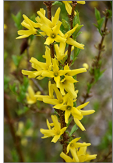
Bronx Forsythia flowers

Bronx Forsythia is recommended for the following landscape applications;