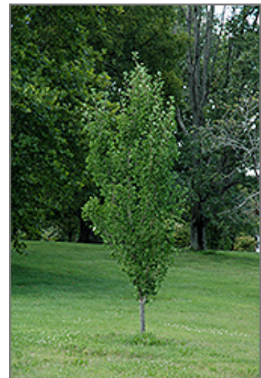
Presidential Gold Ginkgo