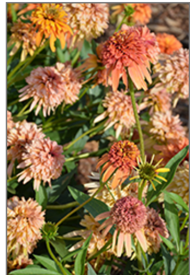
Cone-fections Marmalade Coneflower flowers