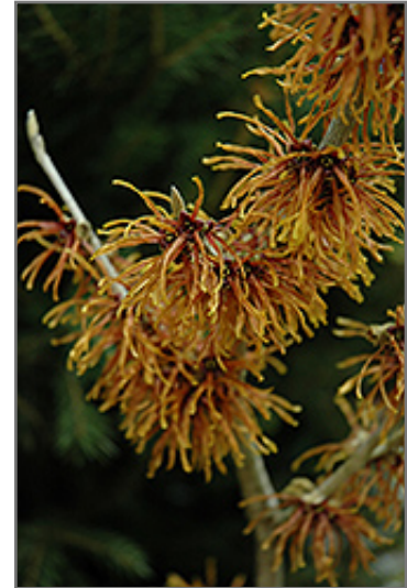
Jelena Witchhazel flowers

Jelena Witchhazel is recommended for the following landscape applications;