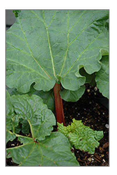
Crimson Cherry Rhubarb foliage