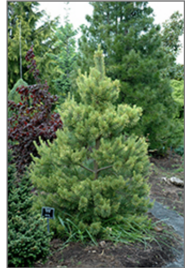
Gold Coin Scotch Pine

This is a relatively low maintenance tree. When pruning is necessary, it is recommended to only trim back the new growth of the current season, other than to remove any dieback. Deer don't particularly care for this plant and will usually leave it alone in favor of tastier treats. It has no significant negative characteristics.