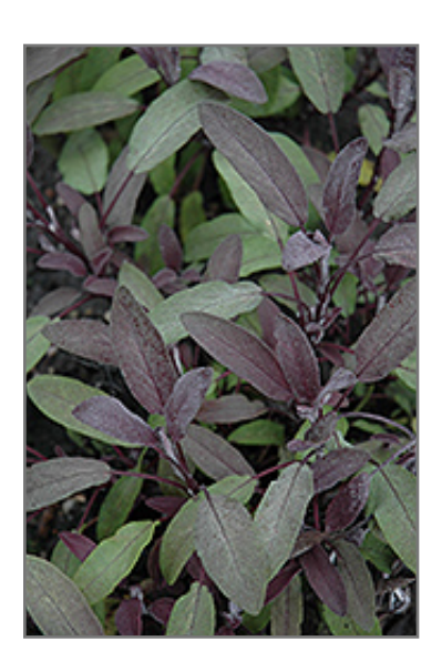
Purple Sage foliage

Purple Sage is a perennial herb that is typically grown for its edible qualities, although it does have ornamental merits as well. The fragrant narrow purple leaves with curious grayish green undersides can be harvested at any time in the season. The leaves have a savory taste and a strong fragrance.