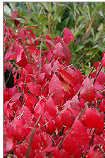
Burning Bush (tree form) in fall