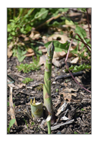
Jersey Giant Asparagus fruit