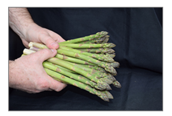
Jersey Giant Asparagus fruit