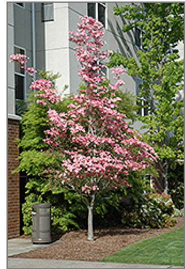
Cherokee Brave Flowering Dogwood in bloom