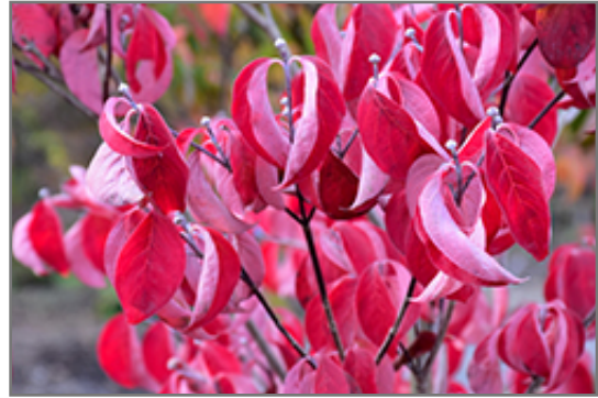
Cherokee Brave Flowering Dogwood in fall

Cherokee Brave Flowering Dogwood will grow to be about 30 feet tall at maturity, with a spread of 35 feet. It has a low canopy with a typical clearance of 4 feet from the ground, and should not be planted underneath power lines. It grows at a slow rate, and under ideal conditions can be expected to live for approximately 30 years.