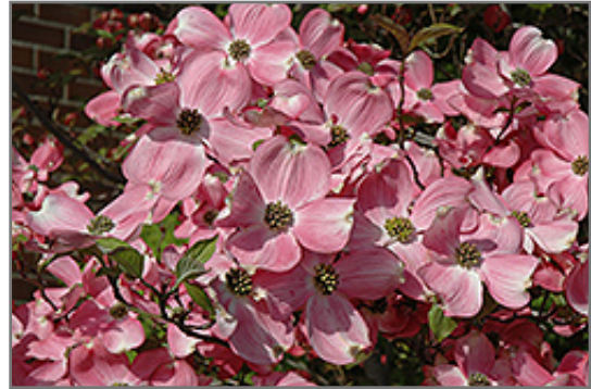
Cherokee Brave Flowering Dogwood flowers

This is a relatively low maintenance tree, and should only be pruned after flowering to avoid removing any of the current season's flowers. It is a good choice for attracting birds to your yard. Gardeners should be aware of the following characteristic(s) that may warrant special consideration;