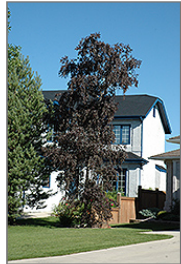
Royal Frost Birch

Royal Frost Birch will grow to be about 40 feet tall at maturity, with a spread of 25 feet. It has a low canopy with a typical clearance of 3 feet from the ground, and should not be planted underneath power lines. It grows at a fast rate, and under ideal conditions can be expected to live for 40 years or more.