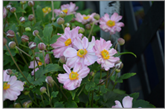
Fantasy Pocahontas Anemone flowers

Fantasy Pocahontas Anemone is recommended for the following landscape applications;